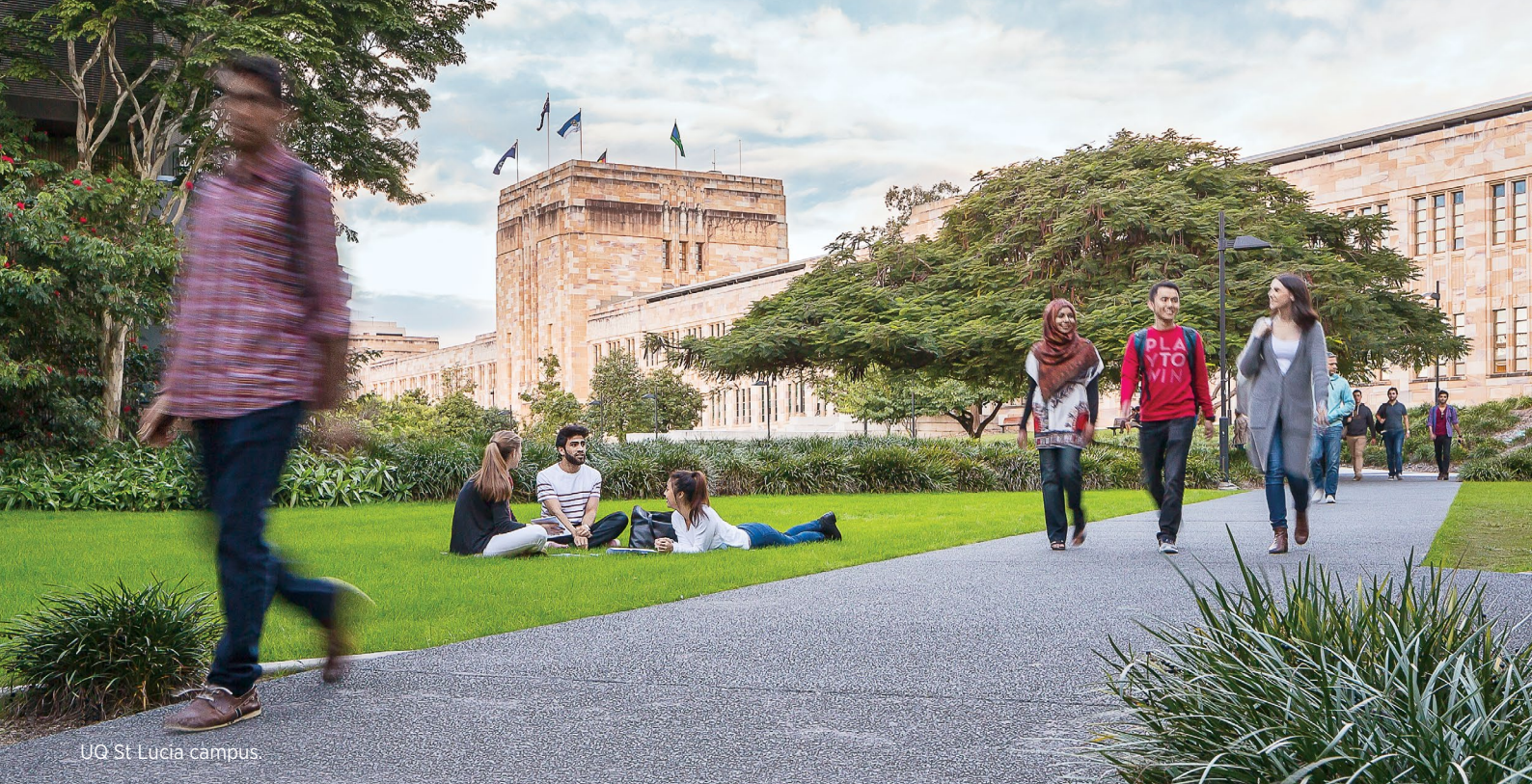
UQ St Lucia campus