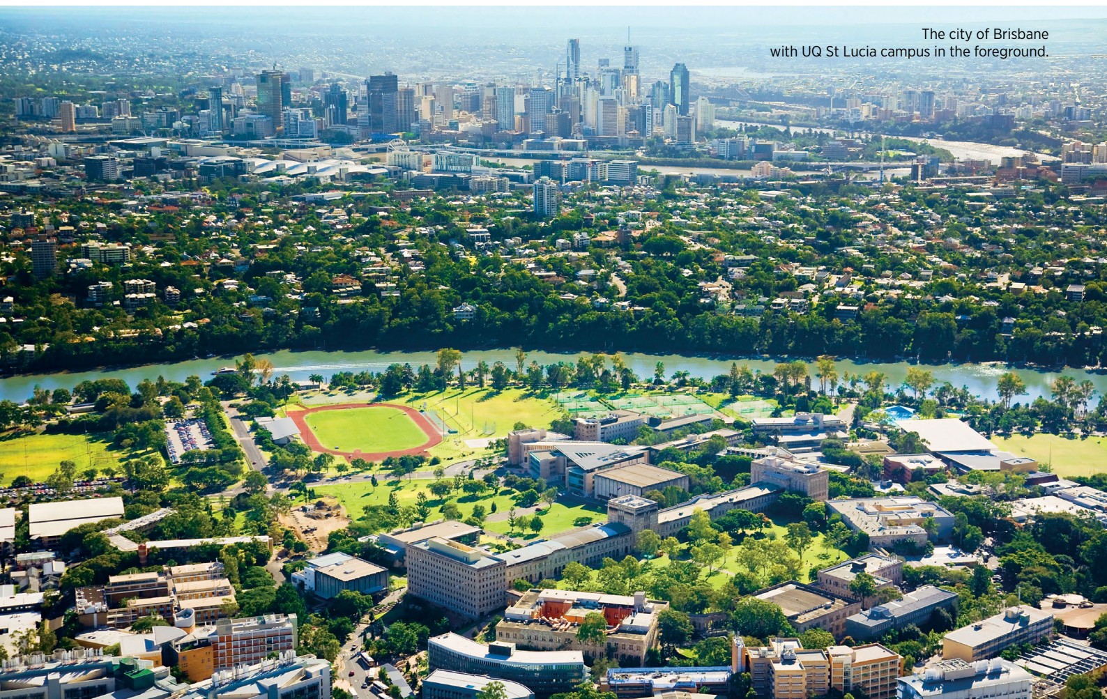
The city of Brisbane with UQ St Lucia campus in the foreground.